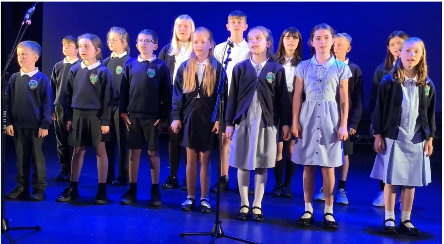
What stars! Well done to these performing Badgers who sang brilliantly in their performance at The McMillan Theatre Wednesday evening. Check out the videos on Facebook.